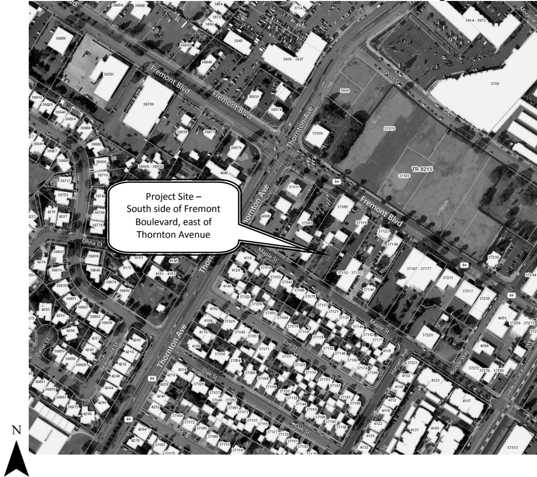
Figure 1: Aerial Photo (2009) of Project Site and Surrounding Area.