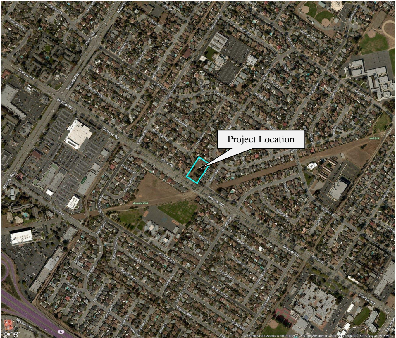
Figure 1: Aerial Photo of Project Site and Surrounding Area.