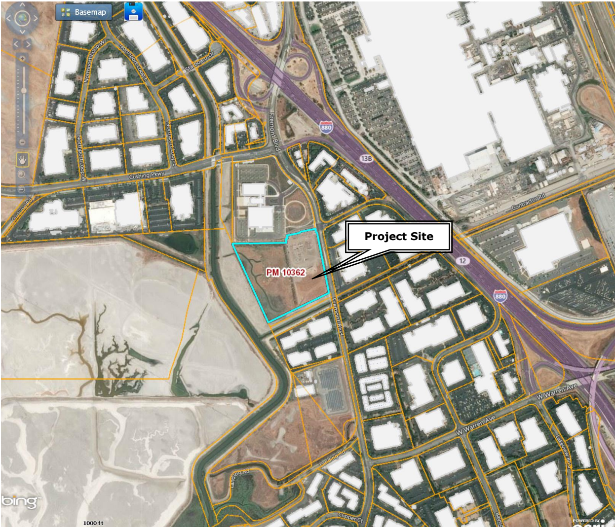
Aerial Photo of Project Site and Surrounding Area.